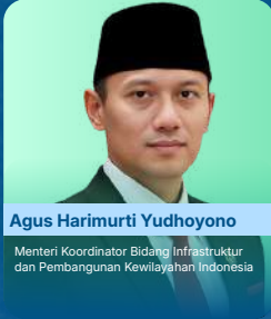
Agus Harimurti Yudhoyono

The Nexus of Business Sustainability, Innovation, and AI